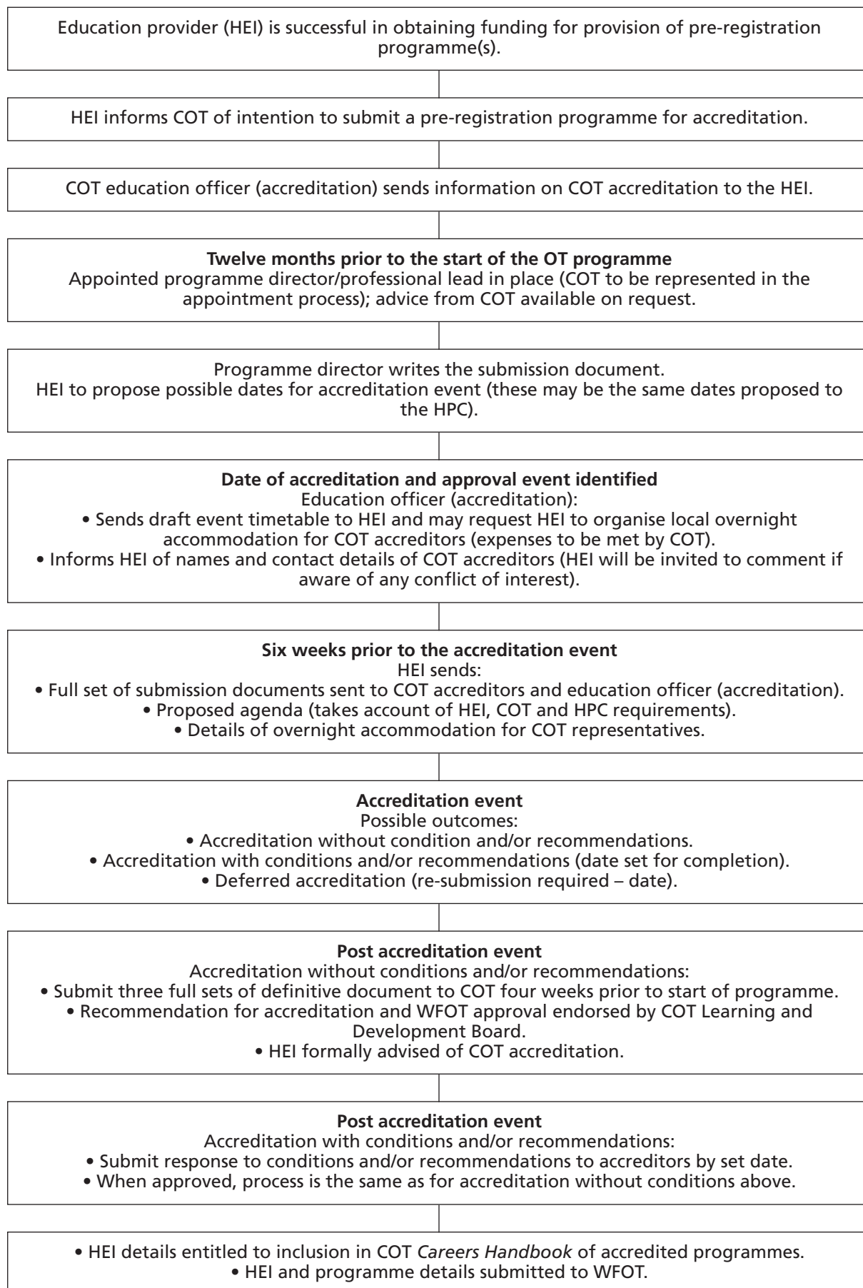
Figure 1 Flowchart for accreditation of pre-registration programmes (new programmes)